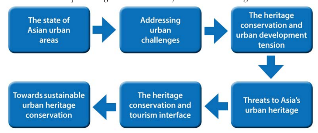
Figure 2.1: Organisational framework

The chapter is organised around key ideas as seen in Figure 2.1.